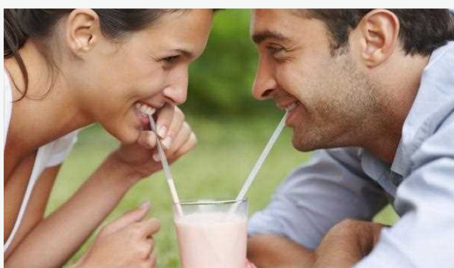
Strongest Male Pheromone

The usage of pheromones at the garments or even body had been used in these days' society to efficiently buildup attraction and decoy in the other sex simply by the lone scent that's connected to a particular human's pheromone spray or oil founded solution.