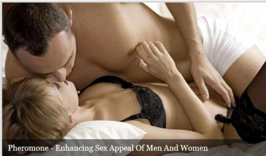
Pheromone - Enhancing Sex Appeal Of Men And Women