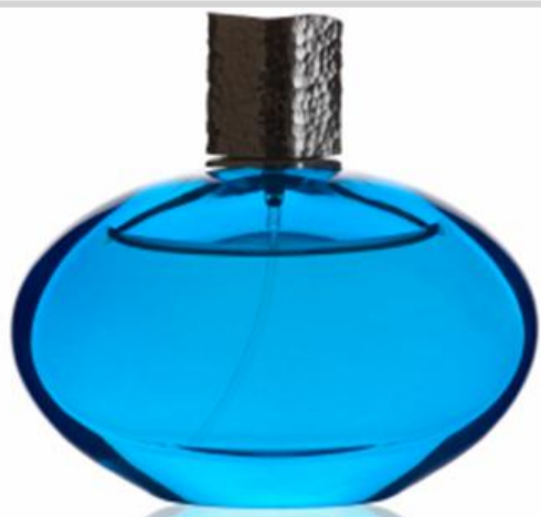
Pheromones And Increased Attractiveness