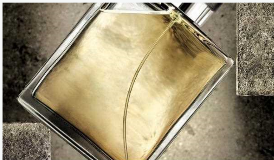
Pheromones Pheromones Attract Women Pheromones Attract Attract